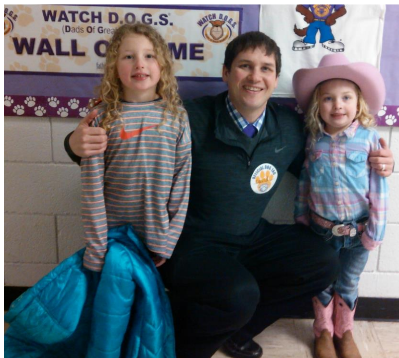
Top left clockwise: WATCH DOG reading with kindergarten; Two of our WATCH DOGS; February Students of the Month